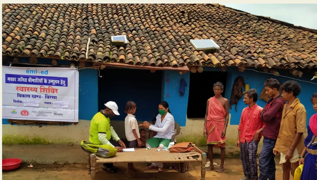
Malaria screening in Balaghat district, Madhya Pradesh

ASHA/USHA workers were initially not confident in administering the rapid diagnostic testing kit (RDT) for malaria. After hands-on training and technical trainings using e-modules developed by FH India, they started testing and reporting cases. They also learned dose and medicine administration for malaria. As a result of that screening and testing, number of suspected malaria cases increased and were linked to treatment.