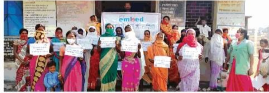
बैहर। जानकारी देते हुए महिलाएं। नईदुनिया

बैहर (नईदुनिया न्यूज)। स्वास्थ्य एवं परिवार कल्याण विभाग और गोदरेज फैमिली हेल्थ इंडिया एवं कम्युनिटी डेवेलपमेंट सेंटर के संयुक्त तत्वाधान में चला रही एम्बेड परियोजना वालाघट जिले के तीन ब्लॉक बैहर, परसवाड़ा, बिरसा में पिछले तीन साल से मलेरिया उन्मूलन कार्य कर रही है। जिसके तहत बैहर ब्लॉक के मुफ्ती, बिरसा ब्लॉक के बहेरभाटा, कच्चापारी, तोरगा और परसवाड़ा ब्लॉक के चिखलाझोड़ी में आठ मार्च को अंतरराष्ट्रीय महिला दिवस मनाया गया। इन सभी महिलाओं को पुष्पगुच्छ से स्वागत किया गया। परिवार और समाज में उनके सहयोग के लिए उनको सराहा गया। गांव को मलेरिया मुक्त बनाने की शपथ ली गई। महिलाओं ने कहा हमारे आसपास