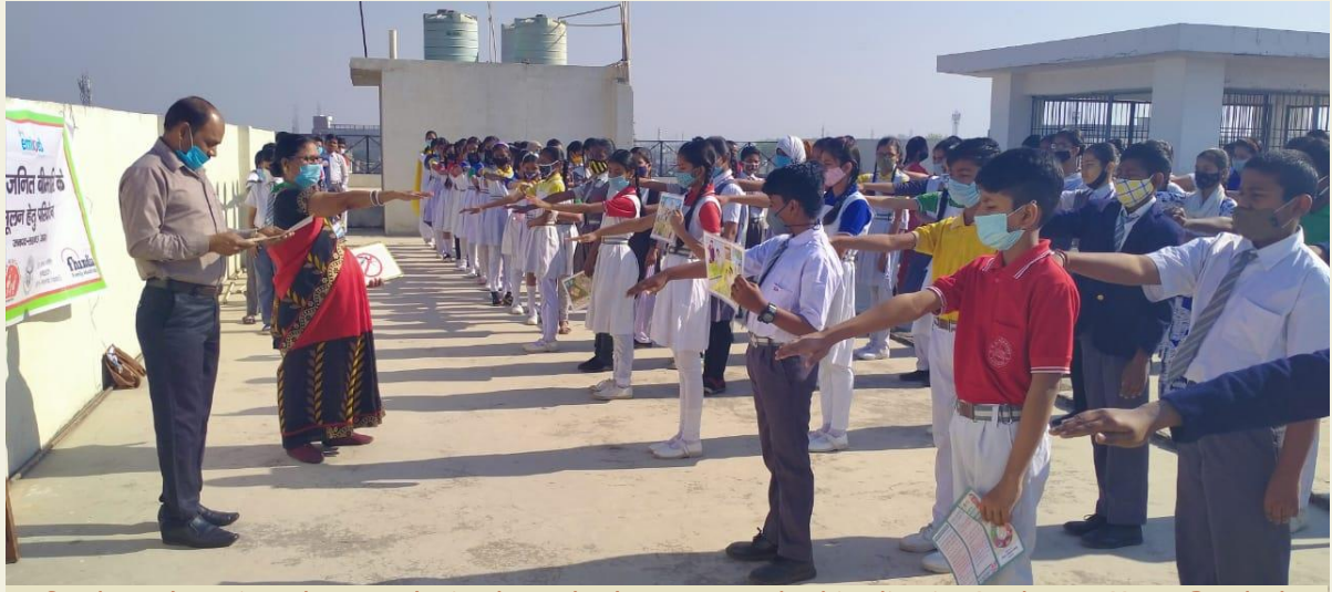
Students learning about malaria through play-way method in district Lucknow, Uttar Pradesh state