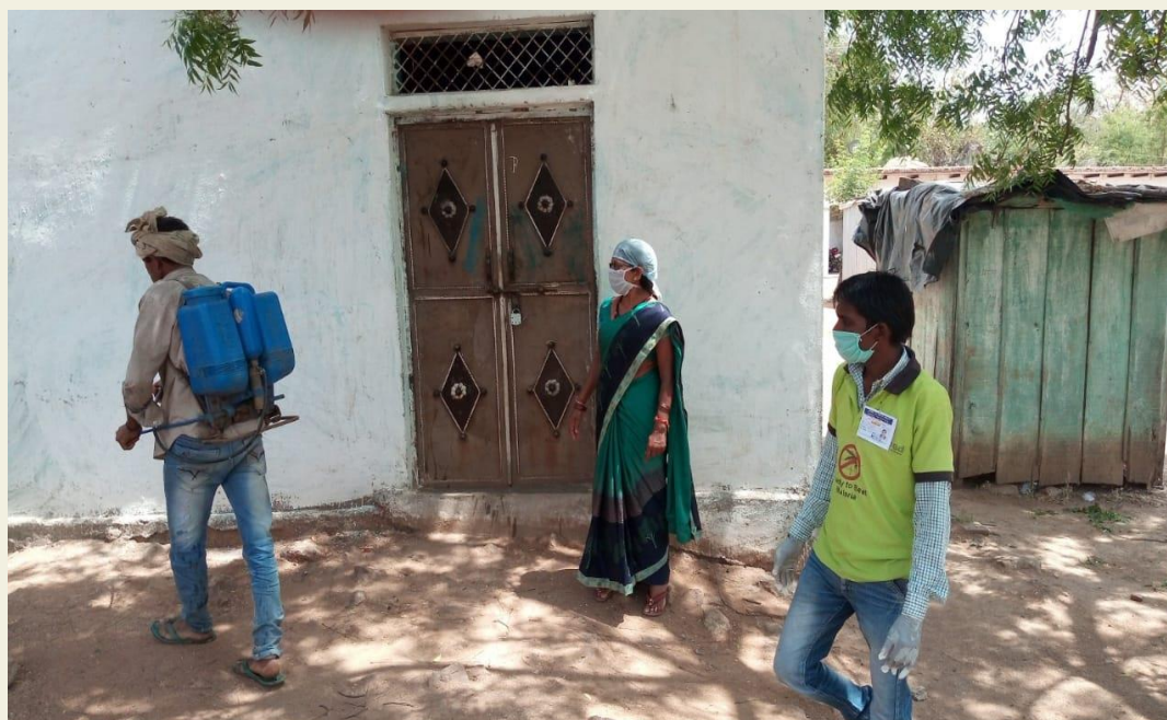
Sanitization work done during Covid-19 in Shivpuri, Madhya Pradesh