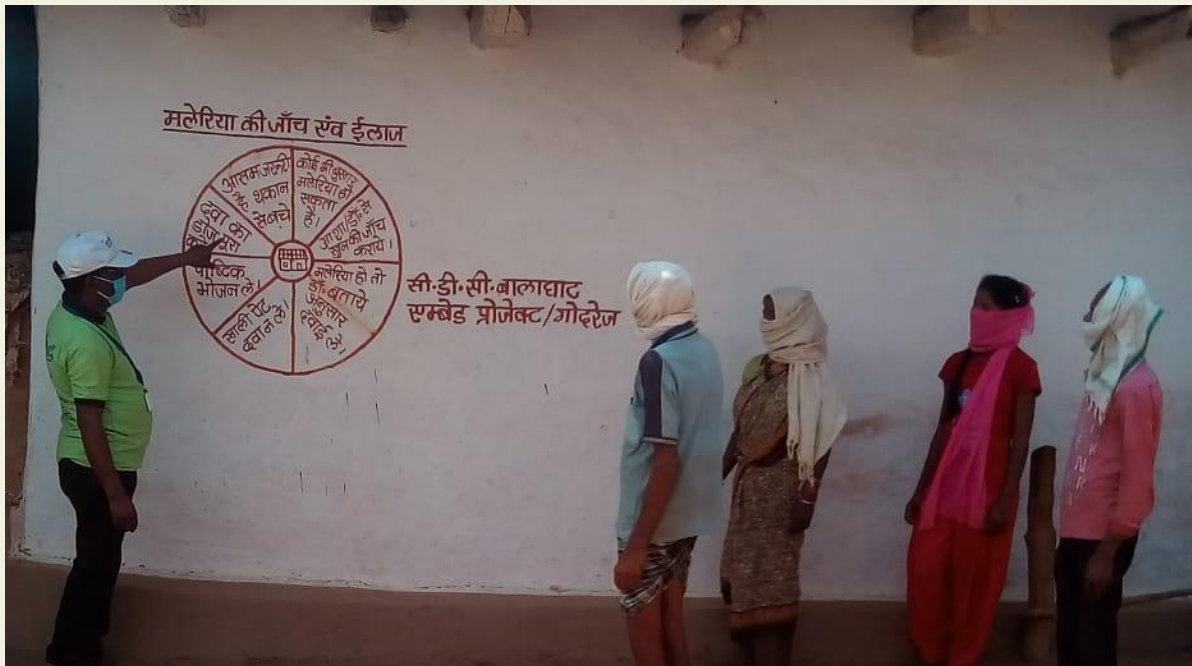
Field worker explaining to community by wall writing