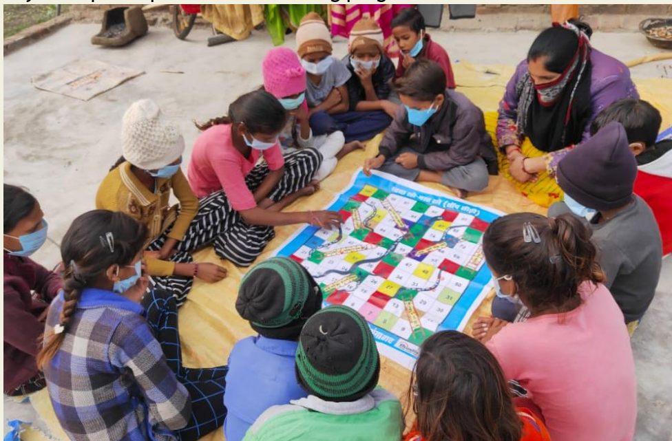
Children's Club Malanpur, Bhind district, Madhya Pradesh

Total 40 youths participated in this training program.