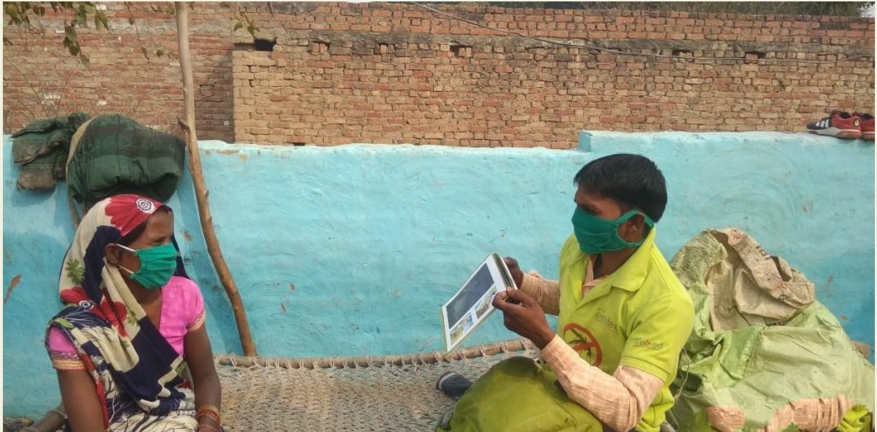
Home Visit session on malaria in Bareilly district of Uttar Pradesh

FH India conducted various community drive events, like Sanitation drives were conducted by village youths to make community aware about use of household toilets by all members, storage and handling of drinking water, handwashing practices by all household members, communication Van, National Dengue Day, National Youth Day, World Malaria Day.