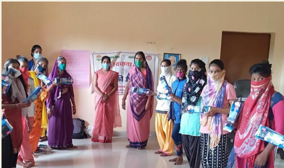
Meeting organised on adolescent health, in Bhind district of Madhya Pradesh

FH India supported villagers mainly youth under project Youth ki Awaz. A total of 370 girls from 16 groups participated in these meetings. Total 80 meetings were organized in the reporting period. Issues of menstrual hygiene, nutrition, anemia, and immunization discussed using PLA tools, games and stories. All girls linked with these groups were provided sanitary napkins.