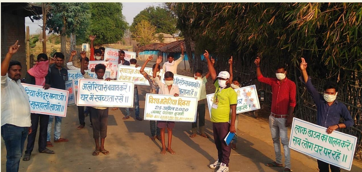
World Malaria Day celebration in district Sidhi, state of Madhya Pradesh

FH India conducted various community drive events, like Sanitation drives were conducted by village youths to make community aware about use of household toilets by all members, storage and handling of drinking water, handwashing practices by all household members, communication Van, National Dengue Day, National Youth Day, World Malaria Day.