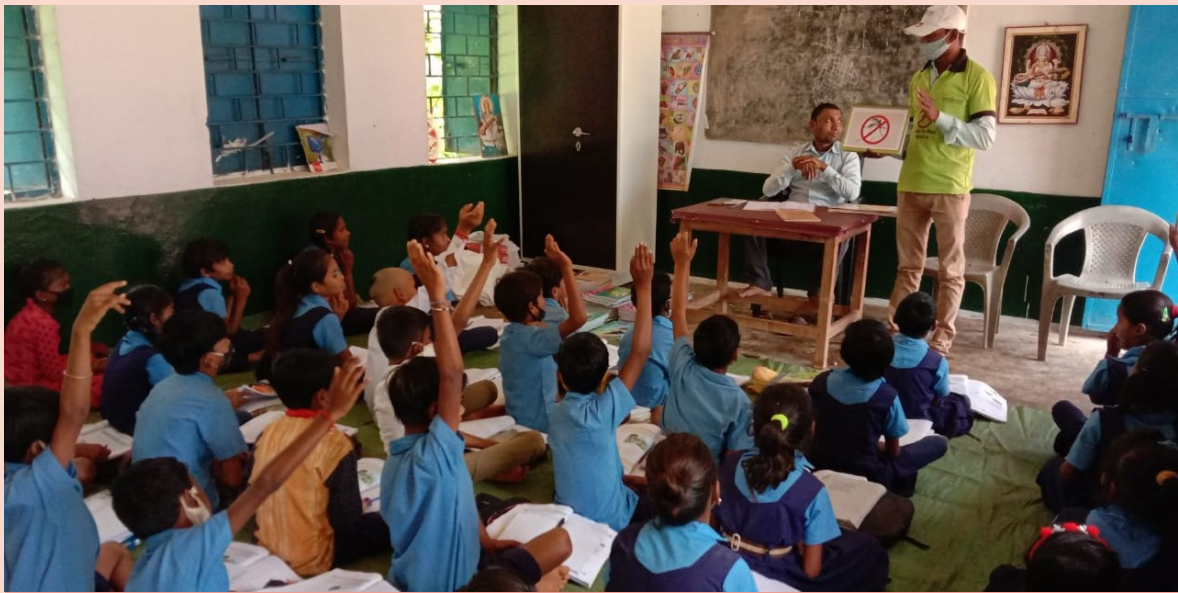
Students learning about malaria through play-way method