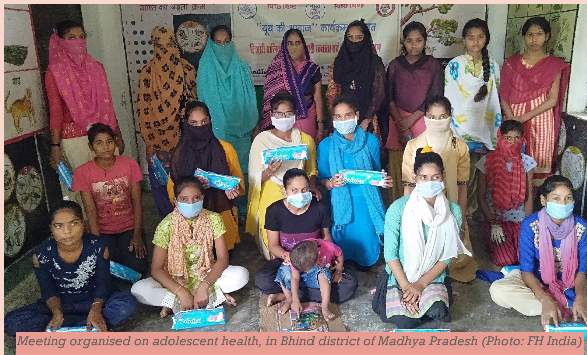
Meeting organised on adolescent health, in Bhind district of Madhya Pradesh

FH India supported villagers mainly youth under project Youth ki Awaz. A total of 357 girls from 16 groups participated in these meetings. Total 112 meetings were organized in the reporting period. Issues of menstrual hygiene, nutrition, anemia, and immunization discussed using PLA tools, games and stories. All girls linked with these groups were provided sanitary napkins.