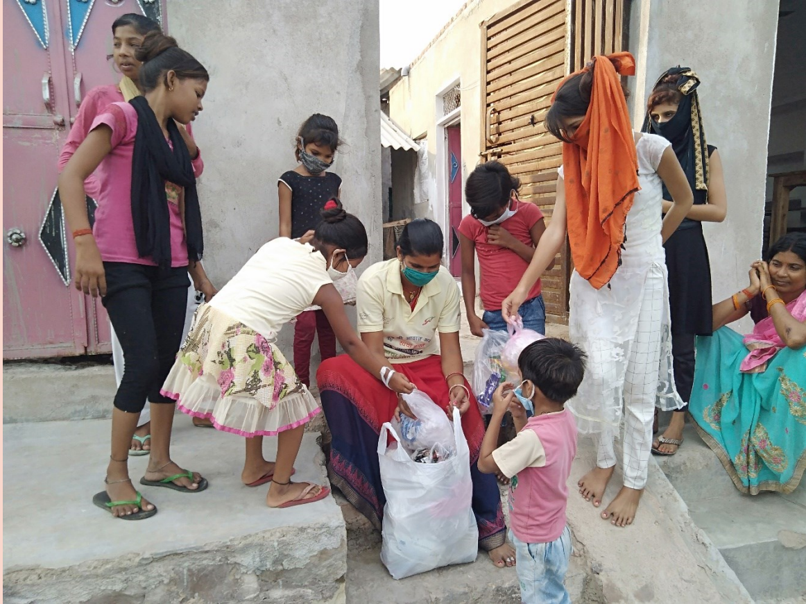
Polythene Collection, in Bhind district of Madhya Pradesh