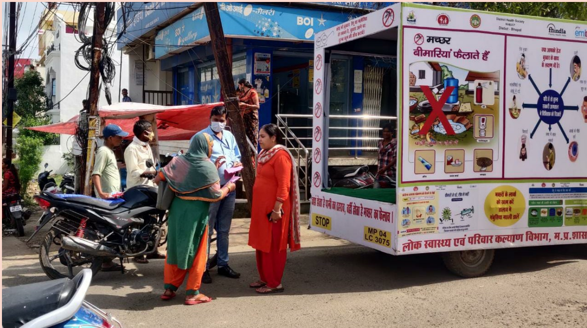
Field worker explaining to community by IEC Van