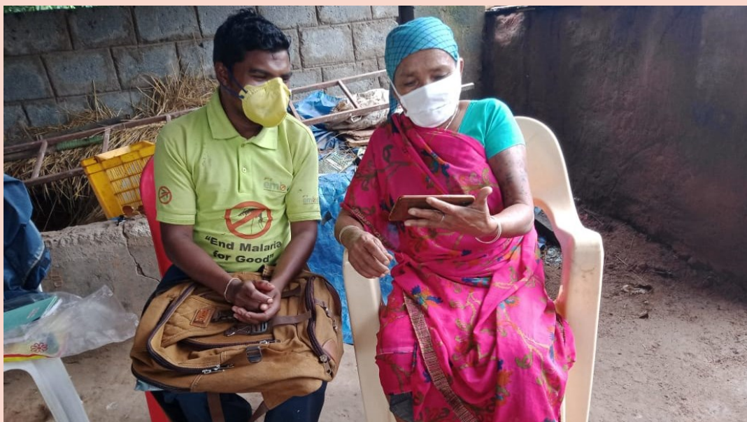
Training of ASHA by e-module

ASHA/USHA workers were initially not confident in administering the rapid diagnostic testing kit (RDT) for malaria. After hands-on training and technical trainings using e-modules developed by FH India, they started testing and reporting cases. They also learned dose and medicine administration for malaria. As a result of that screening and testing, number of suspected malaria cases increased and were linked to treatment.