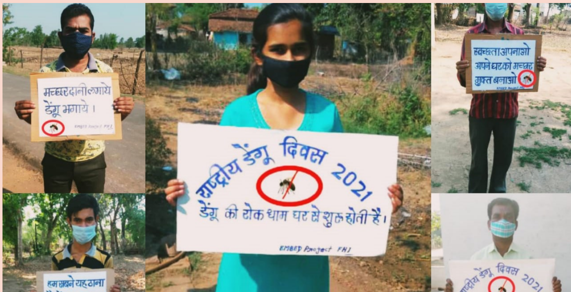
National Dengue Day 2021 celebration in district

FH India conducted various community drive events, like Sanitation drives were conducted by village youths to make community aware about use of household toilets by all members, storage and handling of drinking water, handwashing practices by all household members, communication Van, National Dengue Day, National Youth Day, World Malaria Day.